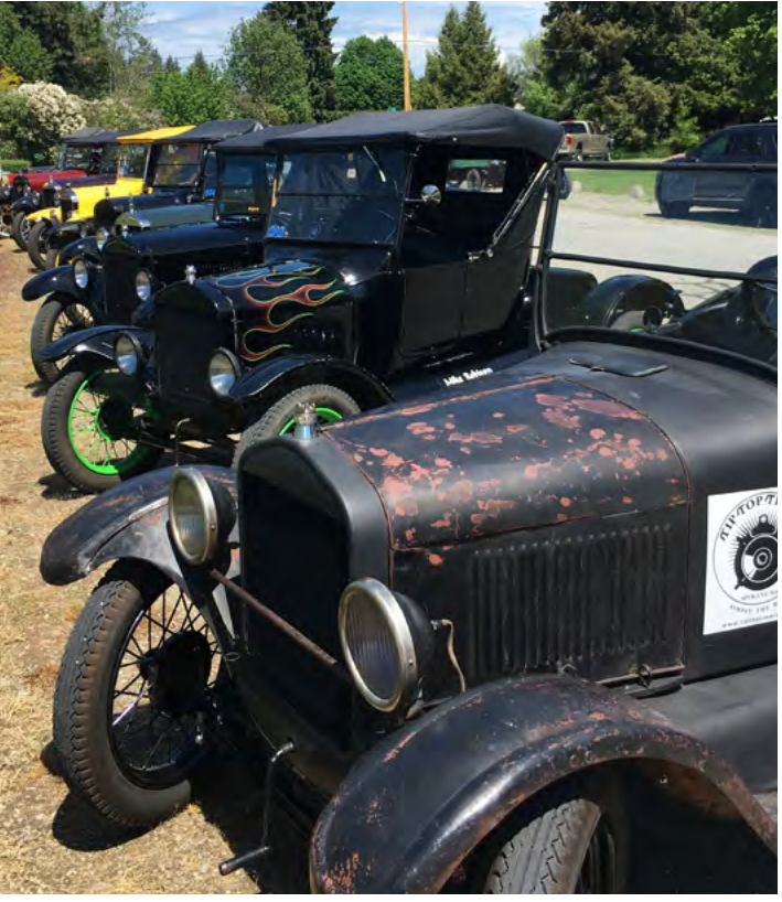
(continued next page)