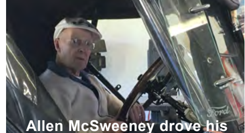
T 67 miles to the Inspection from Colfax, WA (and back)