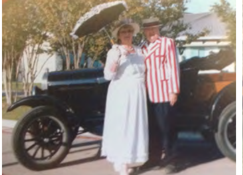
Below - Photos from 2008, 2007, and 2002 Texas T Party Tours