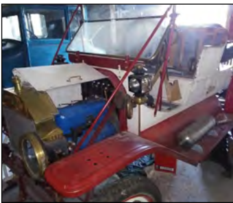
1912 Mother-in-Law Runabout (Commercial Roadster?)