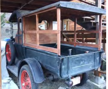
1917 Hard-top Covered Pickup w/ Hasslers (& Ruckstell?)

Newsletter Note: The digital version of this newsletter has been created as an interactive PDF. All web and email links should work in desktop, mobile & tablet browsers. However, on Kindle devices, it is viewable, but interactivity may be disabled until Amazon and Microsoft fix this issue.