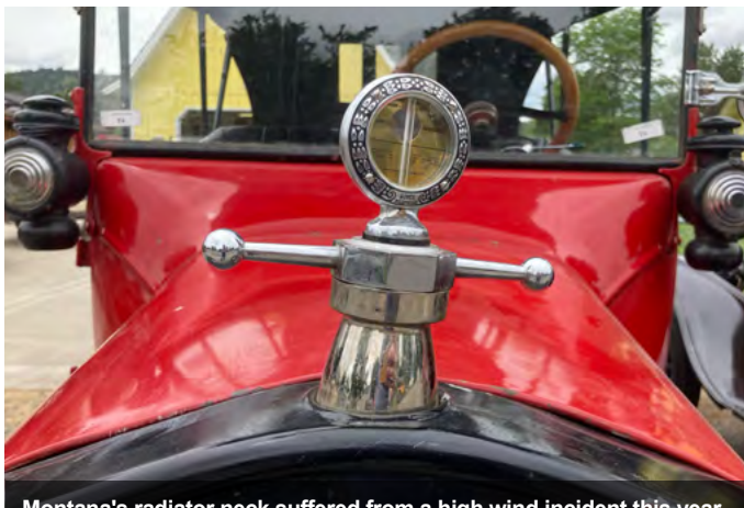
Montana's radiator neck suffered from a high wind incident this year.

IEMTFCA PO Box 11708 Spokane Valley, WA 99211-1708