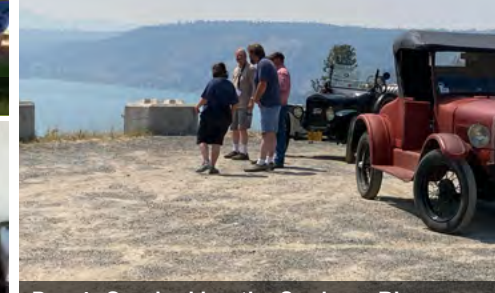
Day 4- Overlooking the Spokane River