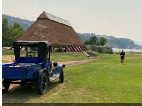
Day 4- Lunch Stop at Two Rivers Resort