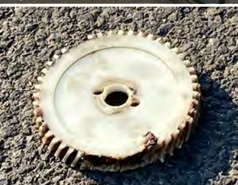
- Mike Robison's Blacktop Fix Ooops