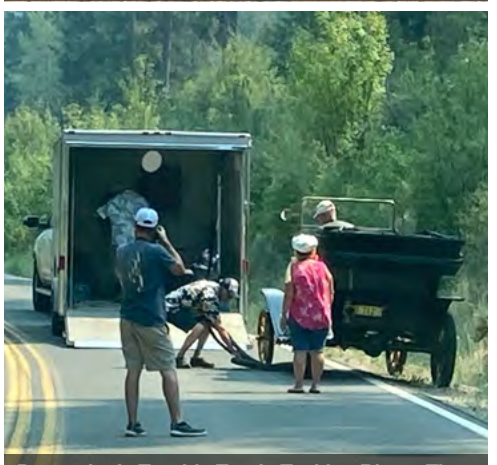
Day 4- Joe's Trouble Truck, T with a Blown Tire