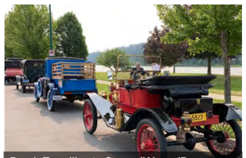
Day 1- Travelling to Coeur d'Alene, ID