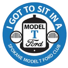
Stickers to give out to kids