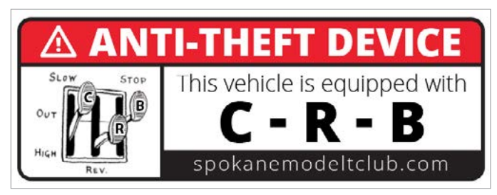
Funny Anti-theft Window Decal