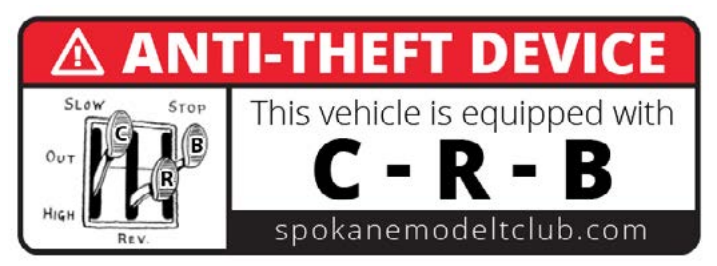
Funny Anti-theft Window Decal