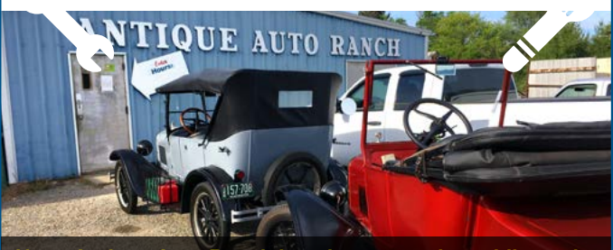
Note: Antique Auto Ranch is only open to the public on the first Tues of each month. Other times by appointment.