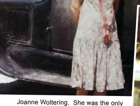
woman Model T driver in the club during the mid 70's and 80's.