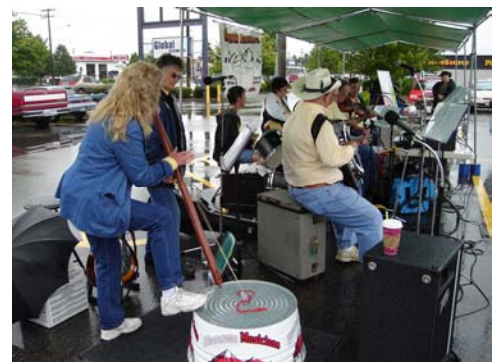
Jammers and put on quite a show.