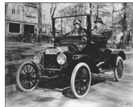
1915 – Couplet

Dues are $20 per year. They are now past due. All correspondence should be directed to the mailing address. Ads for Ford parts and cars wanted and for sale and submissions only should be sent to the editor via email or snail mail. Deadline for submissions is the 18th of the month..