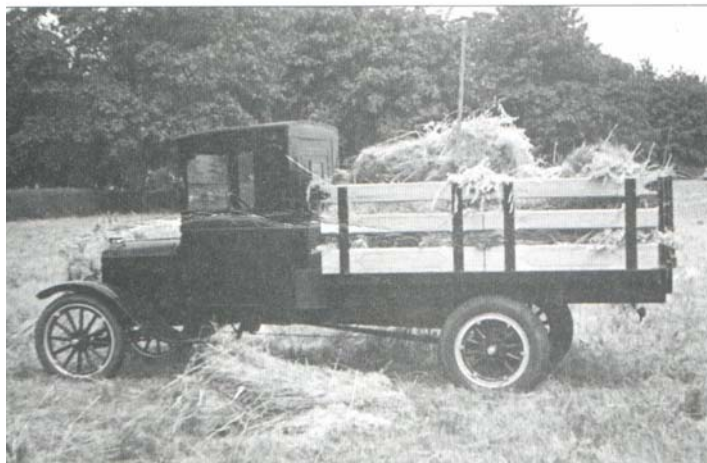
The lead picture from 7 page article by our own Grant L.