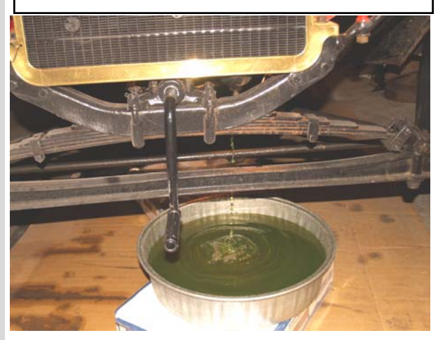
Don't forget the Antifreeze before you go to the tour! It's COLD out!