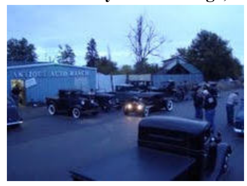
Oct 3rd End of Summer T Tour