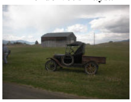
April 24th Guild School Penny Drive..