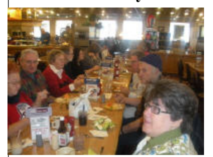
Tuesday Nites at the Ranch