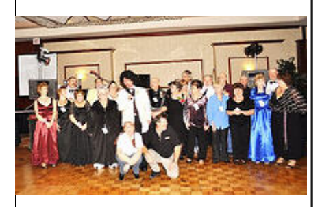
February 27th Fun Card Night at Skidmore's ..