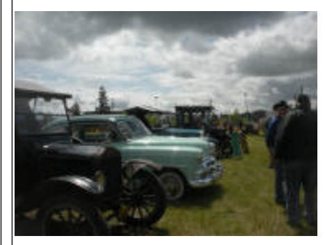
May 16th Safety Inspection at Skidmore's.