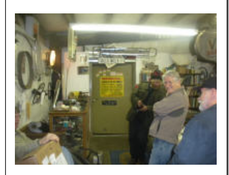
February 20th Show-No-Shine..