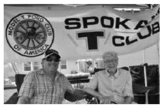
August 1-6th 2010 Western National Tour Whitefish, MT..