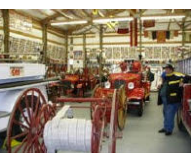
June 26, 2010 The Spokane T-Club Car..& Truck Car Show and a Good Sam Car Show