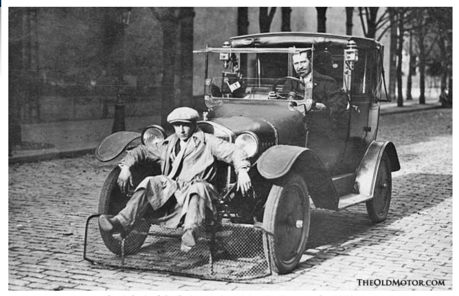
People Catcher Safety Devices - read more in <a href="http://theoldmotor.com/?p=136836">http://theoldmotor.com/?p=136836</a>