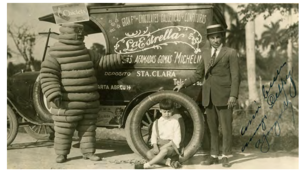
Michelin Man (Bibendum) in 1926 next to an advertising T. 1926 Ad at left. More info: <a href="https://www.businessinsider.com/early-michelin-man-photos-2015-1">www.businessinsider.com/early-michelin-man-photos-2015-1</a>