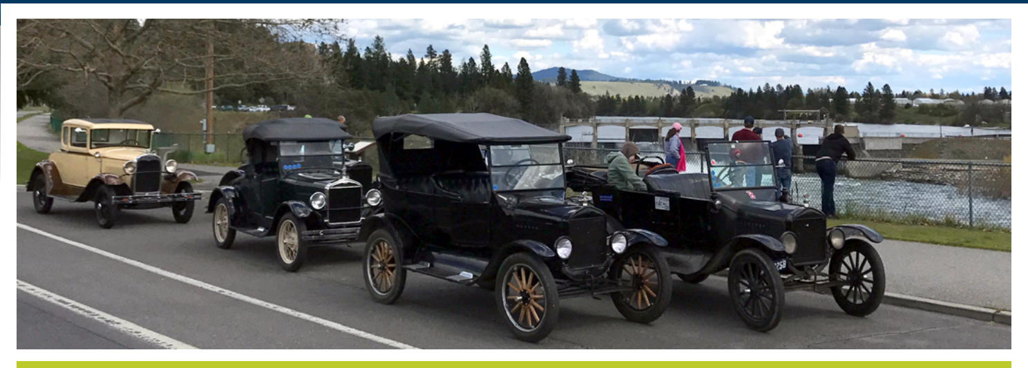
"T"-ball Tour! Gonzaga vs St. Maries • April 29th Short tour, Sonic Drive-in, Gonzaga Baseball!