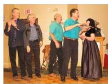
The Band "Sharkey and the Fins"