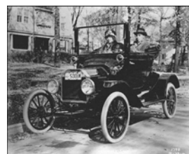
1915 – Couplet - photo - provided via internet.

Dues are $20 per year. They are now past due. All correspondence should be directed to the mailing address. Ads for Ford parts and cars wanted and for sale and submissions only should be sent to the editor via email or snail mail. Deadline for submissions is the 18th of the month..