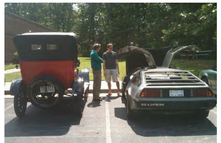
Blacksburg, Virginia next to a friend's DeLorean in 2011