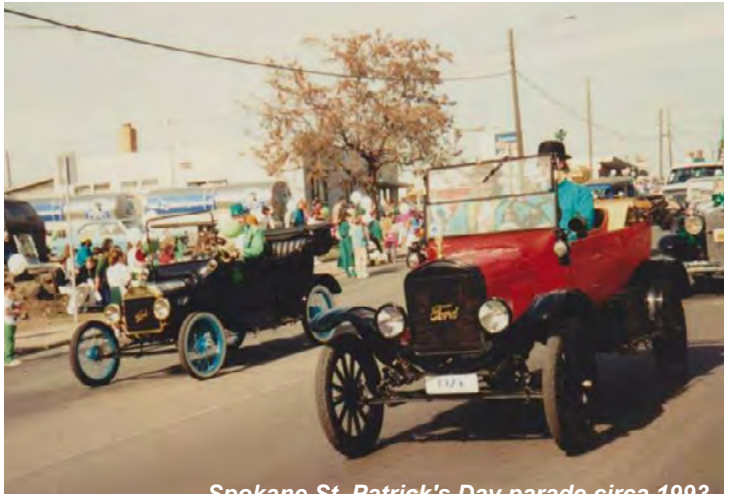
Spokane St. Patrick's Day parade circa 1993