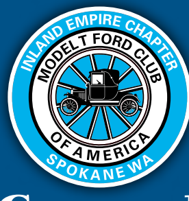
General Club Info

National Clubs We are the Inland Empire Chapter (Spokane) of the MTFCA and the MTFCI