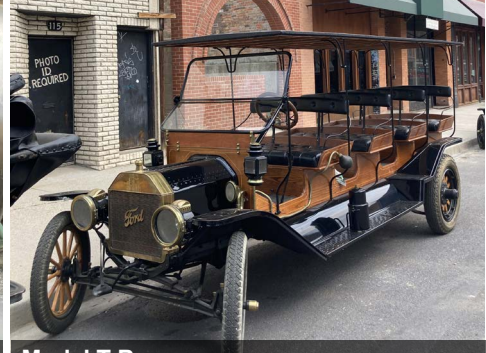
Model T Bus