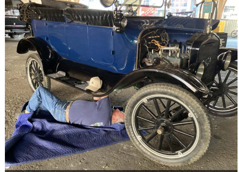
Gas line repairs