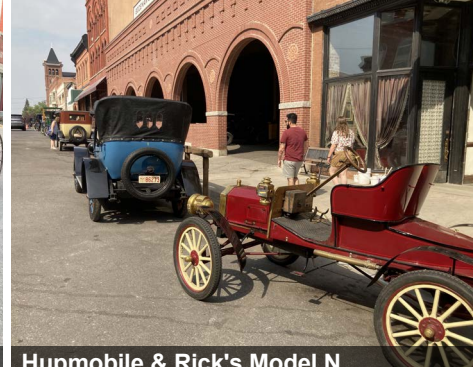
Hupmobile & Rick's Model N