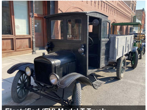
Electrified (EV) Model T Truck