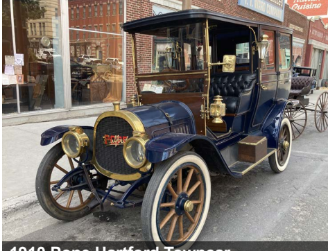
1910 Pope Hartford Towncar