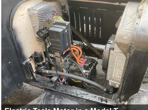
Electric Tesla Motor in a Model T