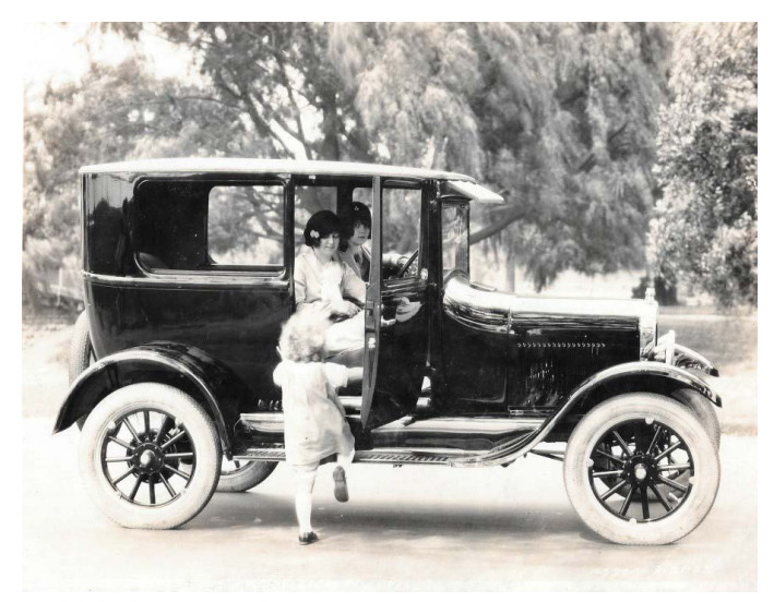
Ford dealership promotional photo