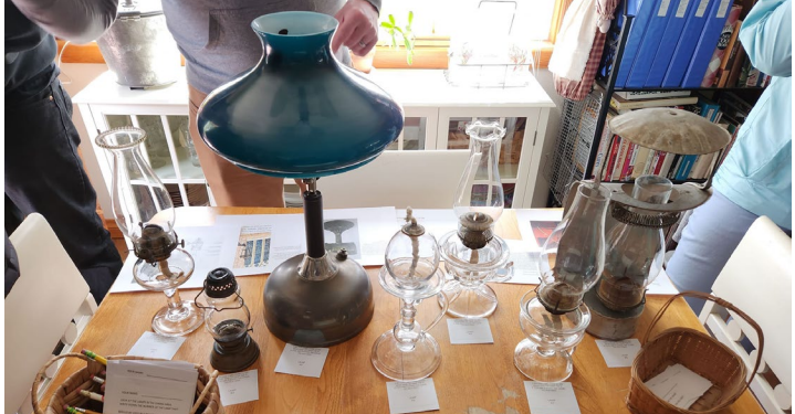
Third Stop (below): Karma Roth's - Glassware Collection