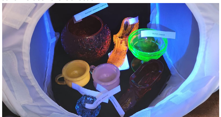
(continued next page)