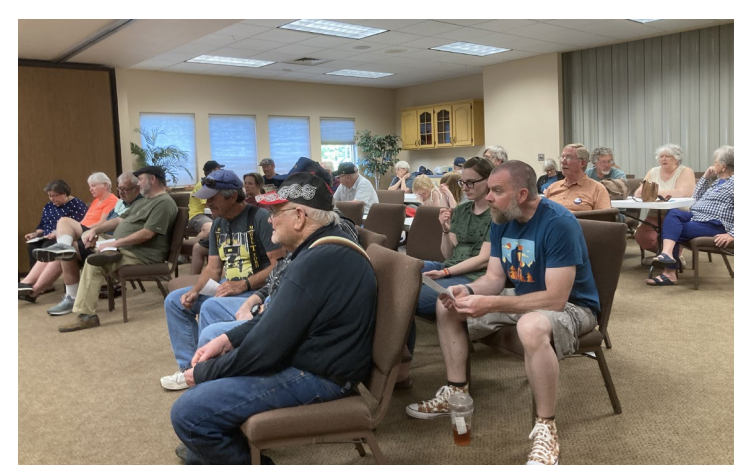
June 2, 2023 Spokane Model T Club meeting attendees

IEMTFCA PO Box 11708 Spokane Valley, WA 99211-1708