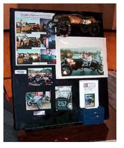
The "Dusty auction" storyboard

have a good excuse, though.) As you can see, from the photo, he clearly missed her, and went home early, missing all the fun. I auctioned off Dusty. Got good money for him too. At the end of the night, we raised over $8,000. Thanks, everyone who came. We got an official "thank you" letter from the church and the family for which the benefit was held.