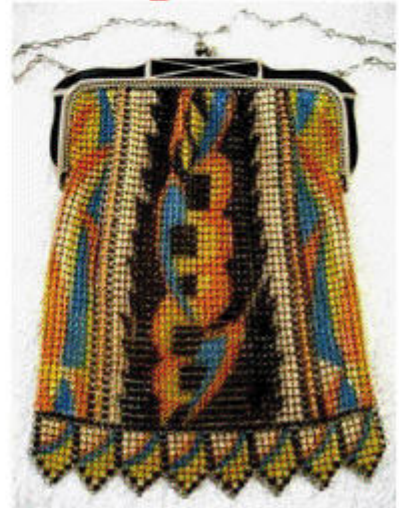
Gorgeous 1920 Whiting & Davis Art Deco Enameled Mesh Purse

By 1912, mesh handbags had become extremely popular and in demand. The Whiting and Davis Company, located in Plainville, Massachusetts is the oldest purse company in the US and is responsible for a great variety of exceptional mesh purses.