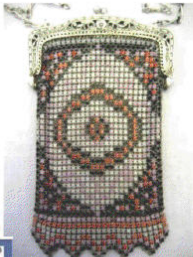
Early Whiting & Davis Enameled Mesh Purse, ca. 1900-1920

Most of the bags made from 1929 to 1932 were patterned by silk screening where the baby ring mesh took on a soft, hazy, romantic appearance much like a blurred water color. This technique was done by hand over several days of applying one color at a time and allowing 24 hours of drying between colors.