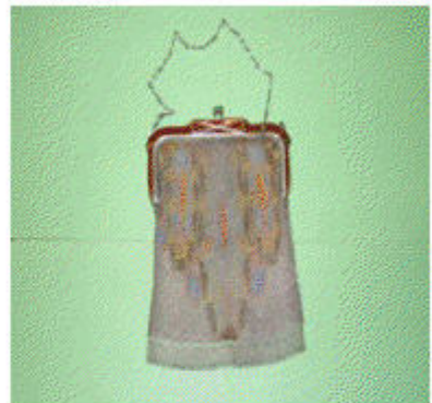
Picture of mesh handbag that once belonged to my Mother.