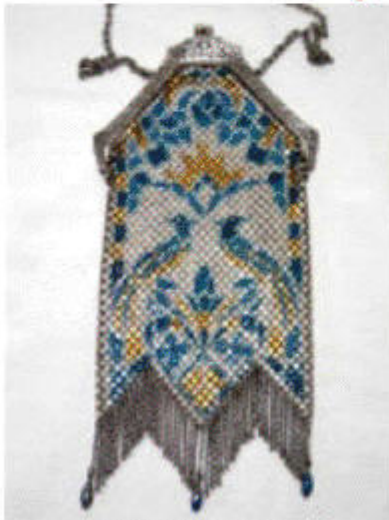
Exotic Mandalian Birds of Paradise Enamel Mesh Purse

Metal mesh bags were hand made by skilled gold and silversmiths as early as the 1820's. In 1909, the mesh making machine was invented by A.C. Pratt of Newark, New Jersey.