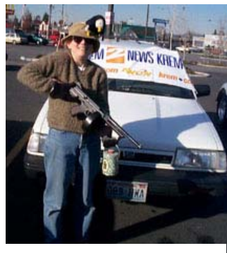
I have to admit to using a little coercion to collect donations in the parking lot

Thank you so much, and happy holidays. See you next year...we hope.