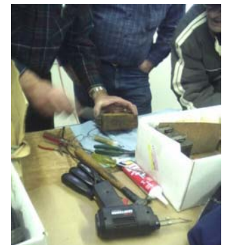
Coils Reborn! See Page 5 for the Whole Story

Stacy’s 50th party brought out some surprise guests! It had been quite a while since some of us had seen the Sills and they had interesting stories to tell. Page 7