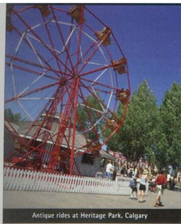
Antique rides at Heritage Park, Calgary

long building with a complex of businesses that faces the river on the west side of the bridge. Festivities begin at 6 pm. Tickets should be purchased in advance from Betty Patterson. $20 per person. Send to 11709 S Greenfield Lane; Medical Lake, WA 99022. Time, at this point, is very short.