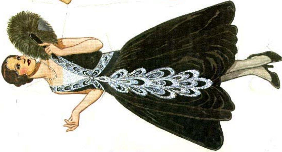
1926 Larvin Picture Dress