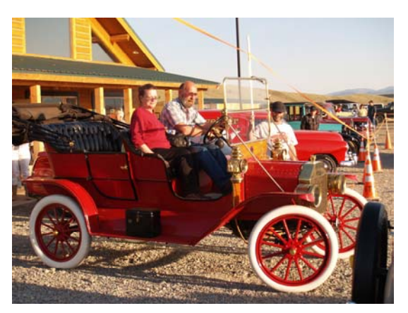
1910-T – Eureka MT. 06 - Driven By One of Our Canadian Neighbors From Red Deer, Alberta.