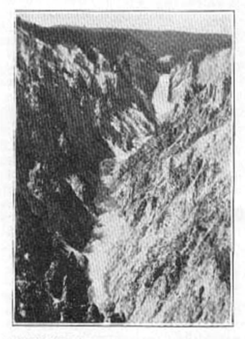
THE GRAND CANYON OF THE YELLOWSTONE.

We decided to work before going further west, and chose Chicago as the most