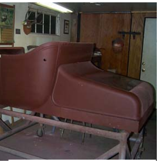
Mike's Current Beloved. (It's Black Now)