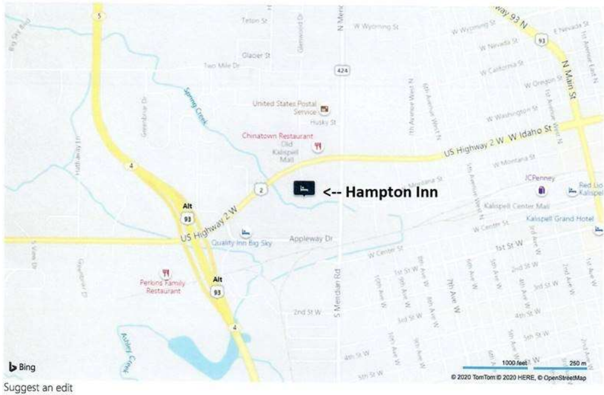
Map to Hampton Inn, Kalispell, Montana

Endurance Inspection starts at Noon on Sunday, June 20, 2021, Meeting following.