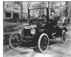
1915 – Couplet - photo - provided via internet.

Dues are $20 per year. They are now past due. All correspondence should be directed to the mailing address. Ads for Ford parts and cars wanted and for sale and submissions only should be sent to the editor via email or snail mail. Deadline for submissions is the 18th of the month..