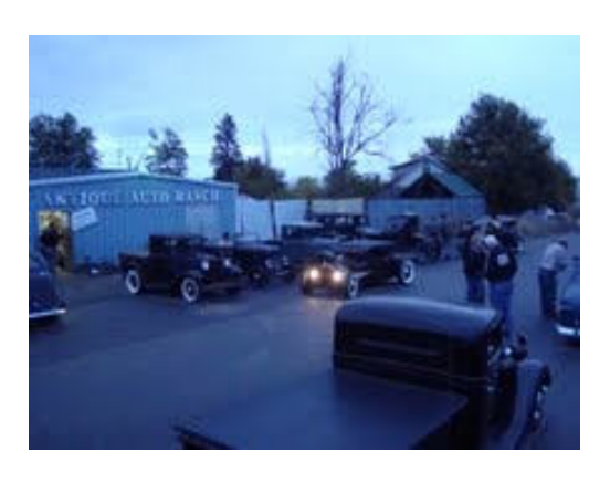
Sept 18 East vs West tour No Overheads 2010

At 6:00 am 5 Model T's and about 10 other flathead powered cars showed up at the Antique Auto Ranch. The group of cars headed out towards Vantage, WA battling the rain in hopes of arriving before 12 noon. The group made stops in Davenport, Odessa, Ephrata, and finally arrived in Vantage around 11:30AM. Blustery's burgers had a large parking lot big enough to hold 300 cars. When all tallies were taken the East side of Washington pulled 47 cars, and the West side could only muster 21 cars. The Spokane Model T Club really impressed all the other car clubs, by showing Model T's are great cars and they can go hundreds of miles with no problems. I would like to thank The Inland Empires and the Ranch for putting on a great afternoon. Hope to see more of you next vear.