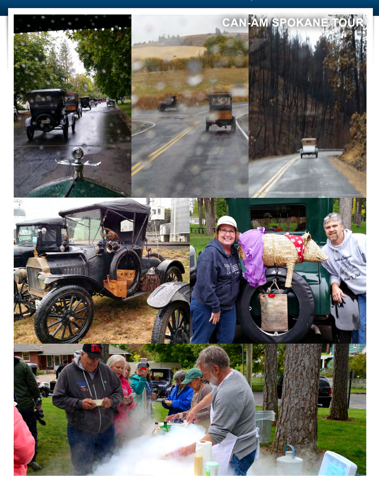
photos provided by Spokane T Club members and tour participants - thank you!