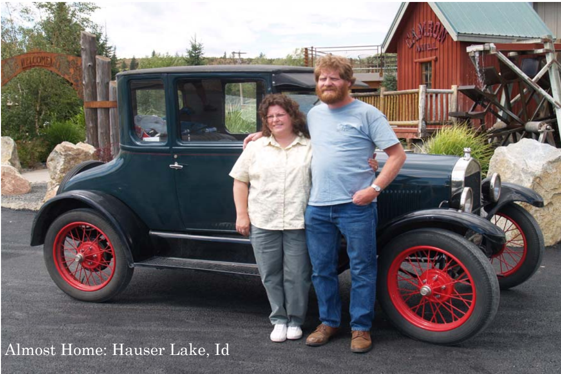
Almost Home: Hauser Lake, Id